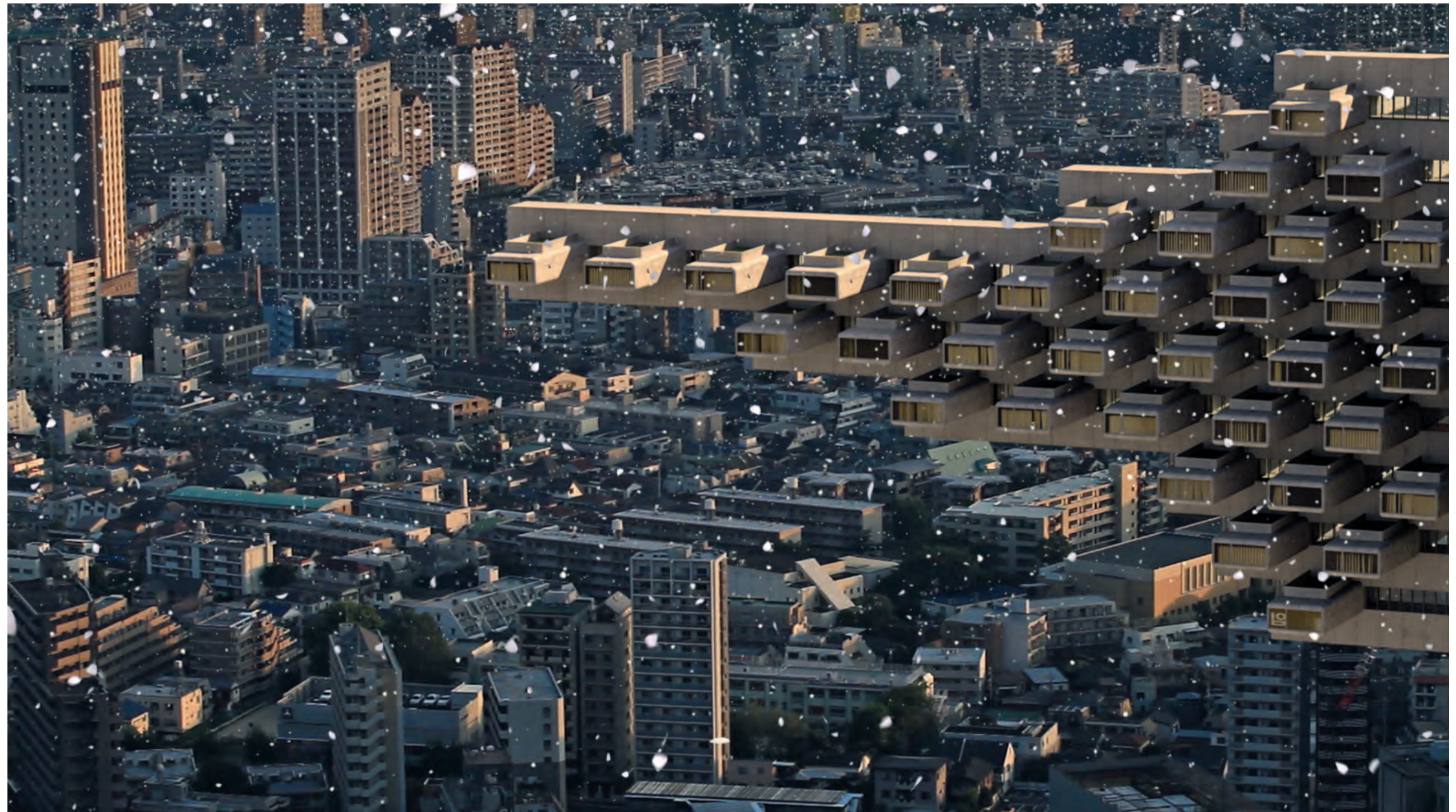
Pierre-Jean Giloux, Invisible Cities # Part 1 # Metabolism , 2015 Video still

Next page Chanéac, Ville alligator , 1968 Ink, felt and gouache on paper