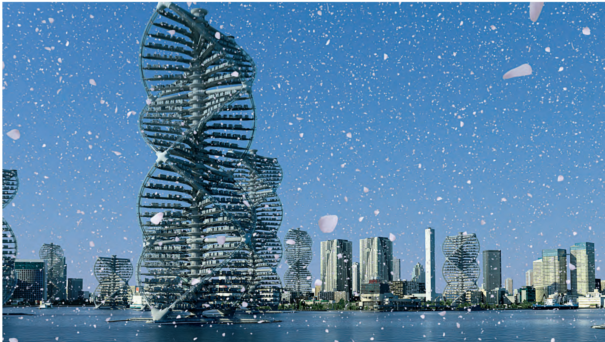
Pierre-Jean Giloux, Invisible Cities # Part 1 # Metabolism , 2015 Video still